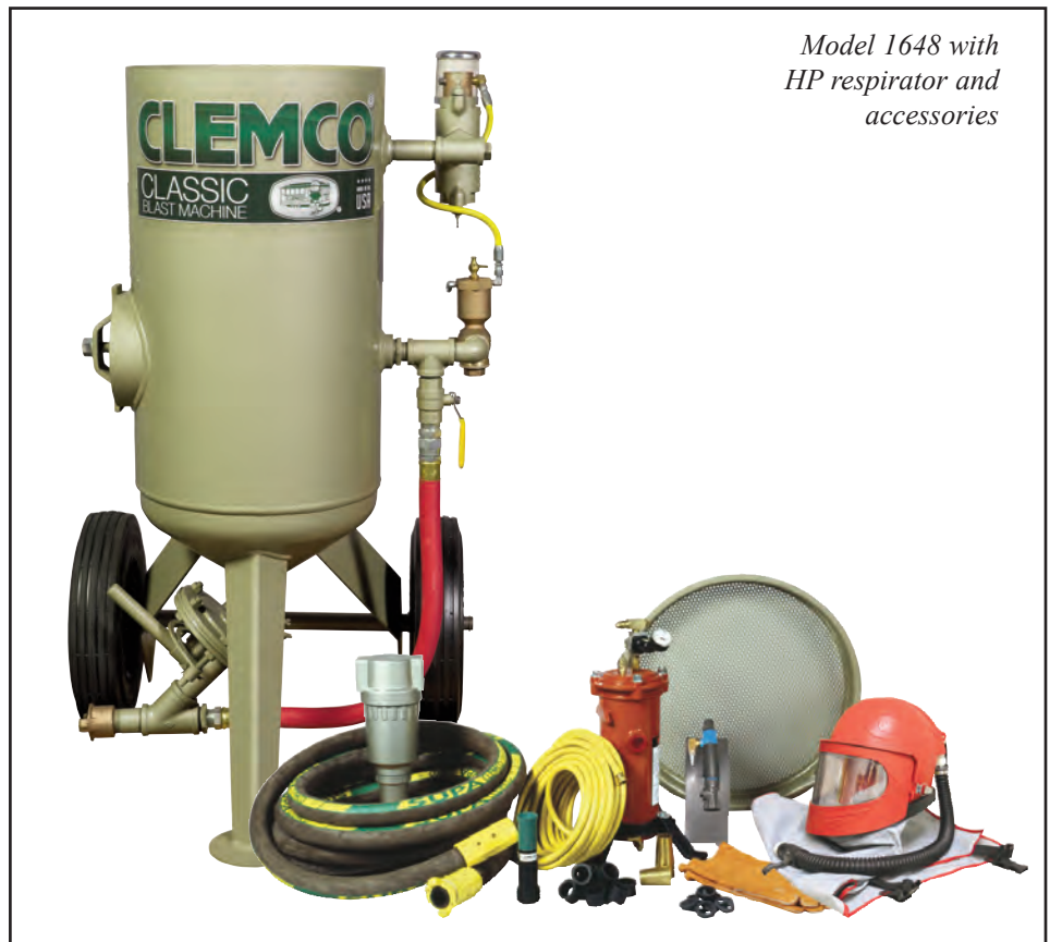
Model 1648 with HP respirator and accessories