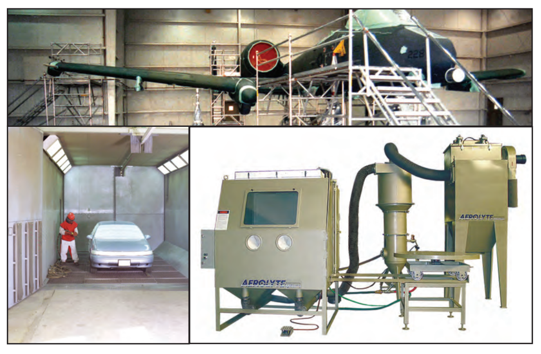
Aerolyte equipment and installations can handle everything from cars and combat aircraft to components and small parts.

The dry strip technology uses non-aggressive media to safely remove coatings five times faster than dualaction sanders, without the risk of gouging, rounding corners, or scratching a delicate surface. As an alternative to chemical strippers, dry stripping eliminates worker exposure to toxic and hazardous substances. Dry stripping drastically reduces hazardous material disposal costs.