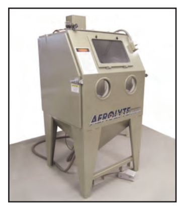
Aerolyte 3636A Dry Strip Cabinet

The Super Comet is ideal for selective stripping jobs where containing the stripping media is desired, keeping the workplace clean.