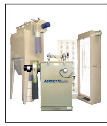
Aerolyte's efficient Dust Collectors

For stripping small components quickly and easily. Available in several sizes, Aerolyte cabinets include the enclosure, pressure blast machine and a choice of dust collectors.