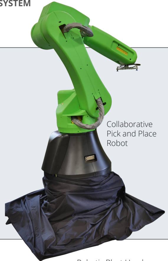
Collaborative Pick and Place Robot