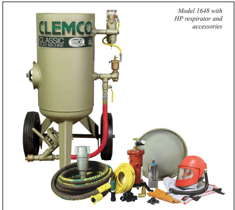
Model 1648 with HP respirator and accessories