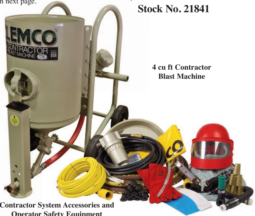
Contractor System Accessories and Operator Safety Equipment

Field portable, high-production, single-chamber blast machine system, rated at 150 psi, for one operator. Holds 4 cubic feet of blast media. Equipped with Millennium pneumatic pressure-release remote controls. System components listed on next page.