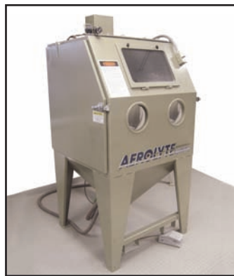
Aerolyte 3636A Dry Strip Cabinet

The Super Comet is ideal for selective stripping jobs where containing the stripping media is desired, keeping the workplace clean.