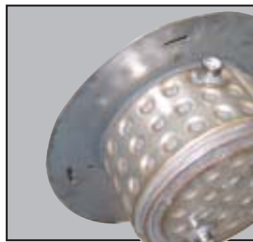
Vacuum Oven Weldment

ISO 9001 - 2000 Certified © 2004 Clemco Industries Corp. Washington, MO 63090