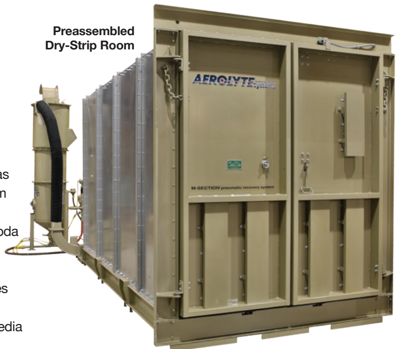
Preassembled Dry-Strip Room

The AEROLYTE preassembled dry strip room is a complete system that contains the dry strip process, and offers efficient media stripping and recycling. It arrives with ready-to-connect components, and easy hook up to air and electric. The system features steep-angle pneumatic M-section® recovery and reverse-pulse dust collection for a clean, efficient operation and rapid recycling of all usable media. A HEPA filter is available as an option.