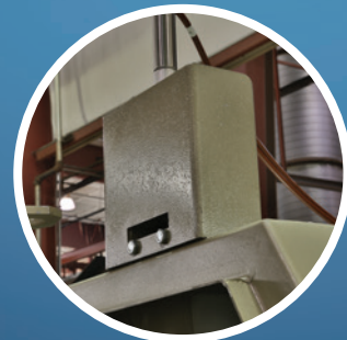
Door Safety Interlocks