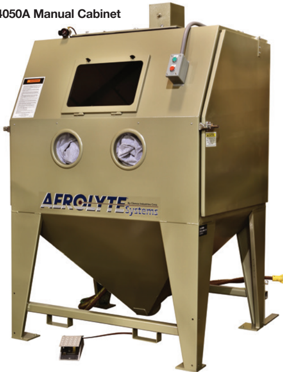
4050A Manual Cabinet

For stripping small components quickly and easily, AEROLYTE cabinets, in several enclosure sizes, are equipped with a pressure vessel, media reclaimer, and dust collector. Standard cabinets are available for one and two operators to let customers select the system that fits their application, environment, and budget.