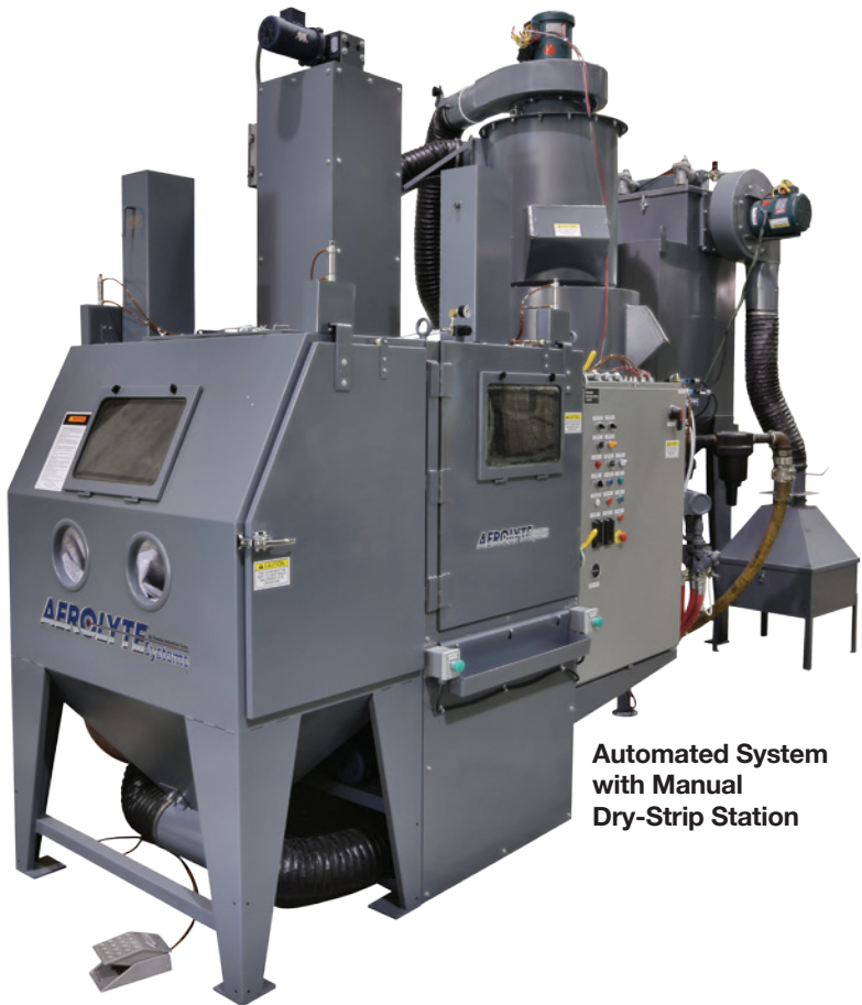
Automated System with Manual Dry-Strip Station

Designed for efficiency and economy, AEROLYTE dry stripping equipment comprises self-contained installations, single and multi-station manual dry stripping cabinets, and automated systems for large scale production requirements. Complimentary sample processing in the AEROLYTE lab serves to help refine customer process requirements, matching them to the equipment solution.